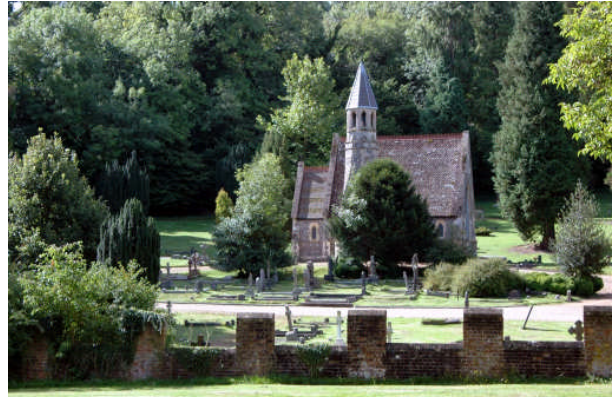
The Church of England chapel seen over the cemetery wall

The cemetery was opened in 1868. It has a wall running round its boundary that originally enclosed four acres of land. This area was extended to the north in the second half of the 20 th century.