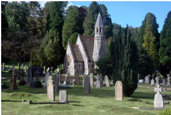
View across the cemetery to the Anglican chapel

When they were in constant use and a cemetery keeper was employed, the chapels were open for visitors. Today they are kept locked.