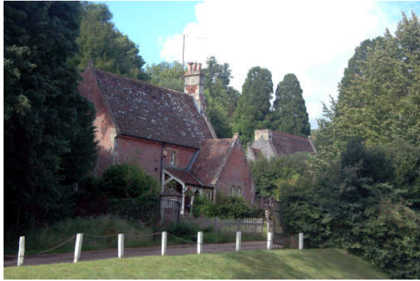
The cemetery keeper's lodge at the entrance to Henley Cemetery

The Henley Cemetery is situated at the north end of the Fair Mile (A4130). It stands on the boundary of Henley and the parish of Bix and Assendon.