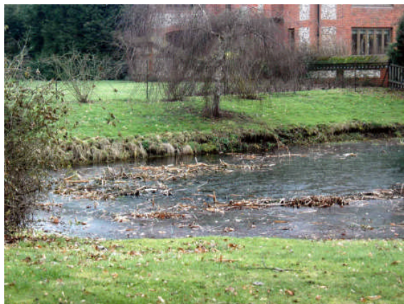
Remains of the moat of Remenham Manor