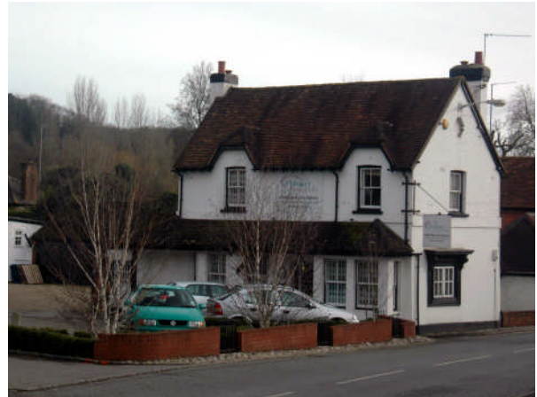
The former Two Brewers PH