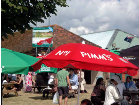
The public bar at Remenham Farm 2008

Today the regatta 'village' has spread to include corporate hospitality on the Buckinghamshire bank and Remenham Farm provides an open-air bar and retail outlets for the general public.