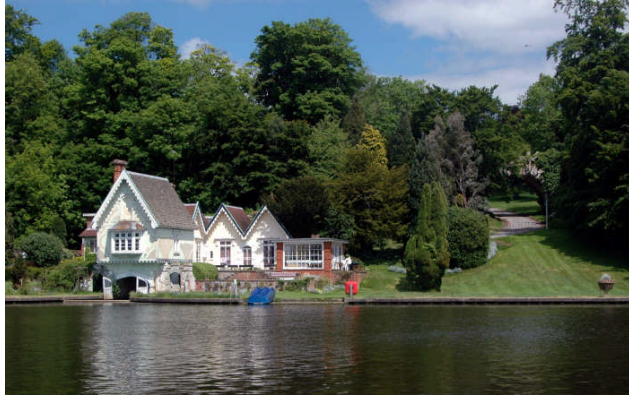
The boat house at Park Place with Conway's bridge

In 1752 Park Place was bought by General Henry Conway. He was responsible for the layout of the grounds, building a bridge (known as Conway's bridge or the Ragged Arch) to carry the Wargrave Road at the lower end of Happy Valley to gain access to the River Thames and a Grecian ruin at the upper end, both using stones from Reading Abbey. A Druid's temple was re-built in the grounds, having come from Jersey, where Conway had been Governor. Following a fire in 1768 the house was partly rebuilt.