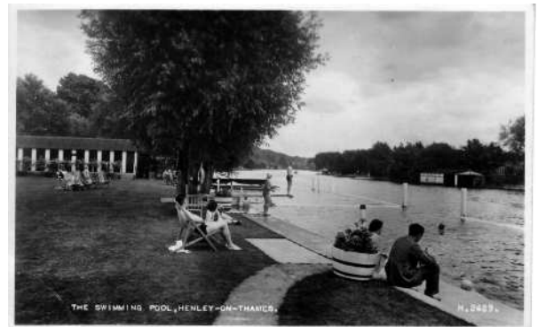
Postcard of Henley Swimming Baths from 1950