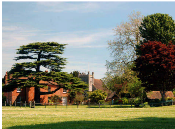
View of Remenham Church and Remenham Farm from the river bank