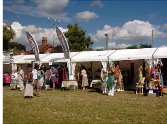
Retail outlets at Remenham Farm 2008