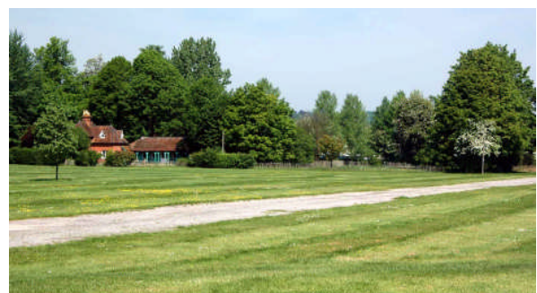
The former site of Henley Cricket Club and its pavilion in 2009, now used for Regatta parking