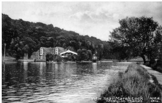
Marsh Mills from an old postcard

A double flourmill, known as Marsh Mills, was situated on the Berkshire bank up until the Second World War. After this the mills were converted into flats.