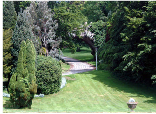
Conway's bridge (The Ragged Arches) over Happy Valley