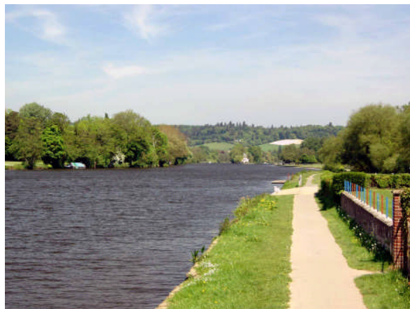
The River Thames downstream from Remenham Club towards Temple Island