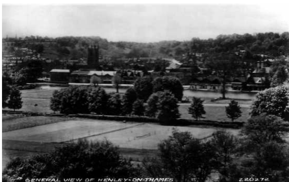
Henley Lawn Tennis Club courts from an old postcard