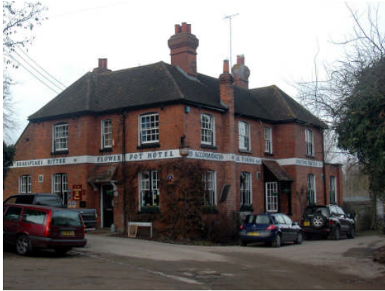
The Flower Pot Hotel

The hamlet of Aston comprises a collection of cottages and The Flower Pot Hotel. Ferry Lane beside the hotel leads to a former ferry across the River Thames.