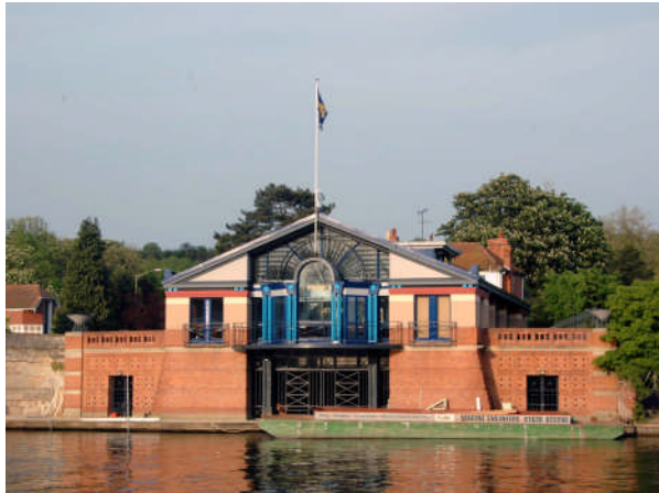
Henley Regatta Headquarters

There is also a small collection of houses and cottages in the area. Along the Wargrave Road, Thamesfield House has been greatly enlarged and is now a retirement home. The site of the Henley Municipal Swimming Baths, called Solomon's Hatch, was a marked off area of the River Thames. Henley Rowing Club now owns it. As a non-swimming junior school pupil in the 1950s, being taken to the baths was an awful experience for me with the river's cold water and a stony bed to stand on.