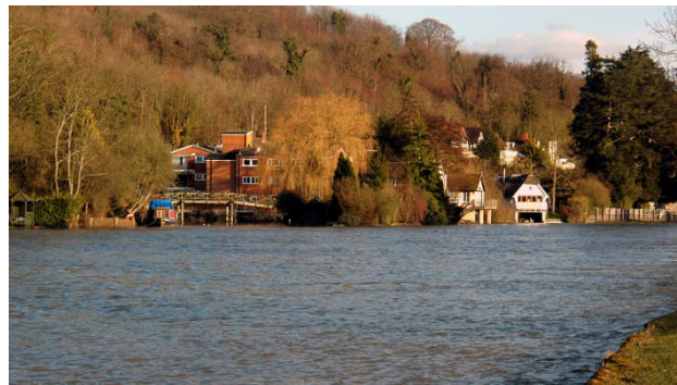
The blocks of red-brick flats at Marsh Mills 2010

River traffic through Marsh lock was originally mainly for carrying goods. The closure of the mills coincided with an increase in pleasure craft on the River Thames and Marsh lock remains one of the busiest locks on the river.