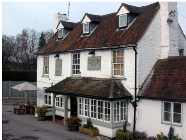
The Little Angel PH