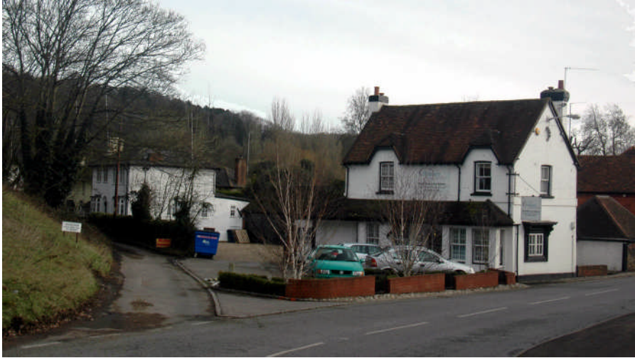
Bank View cottages (left) and the former Two Brewers PH in 2010