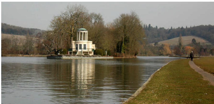
Temple Island in 2010

Nowadays the temple is available for hospitality and functions for up to 40 guests in the Etruscan Room or 120 on the lawns.