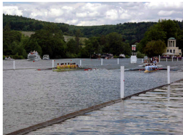
Two crews racing near the start of the Regatta course by Temple Island

Although called Henley Royal Regatta, the administration, boat storage, landing stages, grandstands and car parking for the event are all located in the parish of Remenham. The boat tents and viewing enclosures are situated on the Berkshire bank of the river between the Remenham and Leander Clubs.