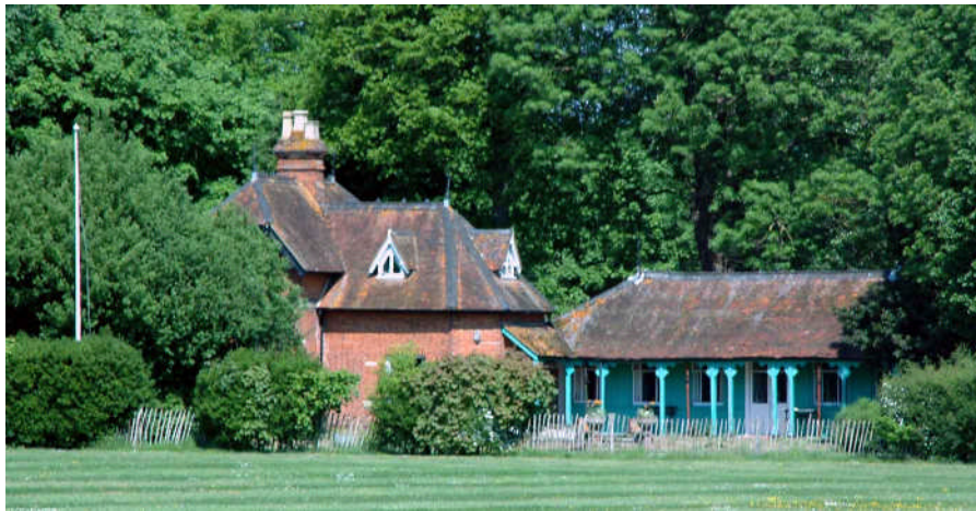
Cricket House in 2009 with the old cricket pavilion attached (right)