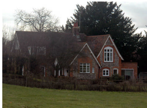
The Old School at Remenham