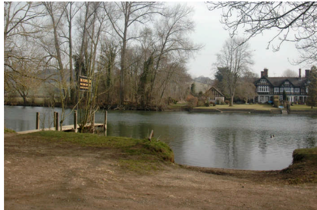
The site of the former ferry at Aston